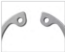
Internal 472 Series