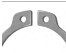
External 471 Series